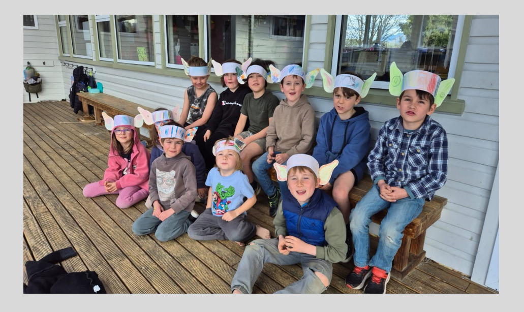
And finally... BFGs ears